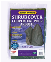
Winter Shrub Cover

Protect your Roses this winter. Simply place over your rose after pruning and the first frost $7.49