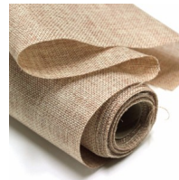
4' Wide Bulk Burlap

Drawstring cover installs easily on shrubs and evergreens up to 4'H & 2.5'W $6.29